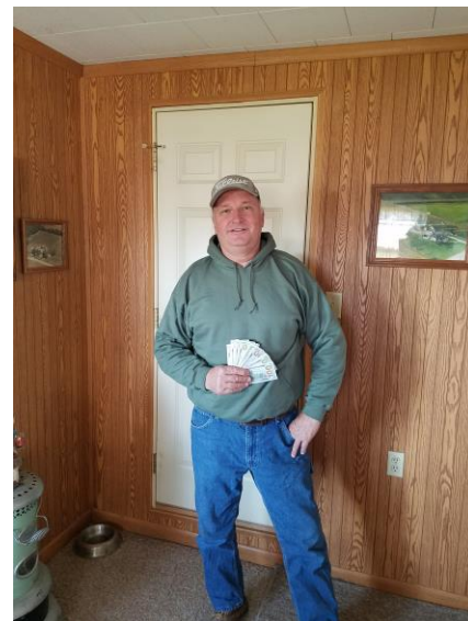
Kent Yoder Asgrow AG29X8 – 79.6 bu/acre