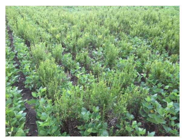
Got Marestail? We have a tool to fix that problem!

In the past several years, marestail (horseweed) has become more of a problem in no-till or reduced tillage situations in soybeans, especially when these burndown applications contain only glyphosate. Dow AgroSciences has introduced a new product called Elevore. Elevore contains Arylex, a new group 4 growth regulator, to provide thorough control of marestail up to 8" tall and other winter annuals. Elevore can be tank mixed with other a preemerge herbicides, has a low use rate of 1 oz/acre and looks to be an excellent fit for notill or reduced tillage situations if you have a marestail problem. Please contact your agronomy specialist for more information or visit: ElevateYourBurndown.com.