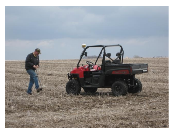
HOW CAN I MAKE MY CROP MORE PROFITABLE?

For the upcoming 2020 season all locations will have Case IH Sprayers with 120 foot booms equipped with the newest Case technology, Aim Command FLEX. The new machines are an investment towards efficiency and accuracy. We will be able to cover more ground with the larger booms and precisely place product with Aim Command FLEX. The sprayers have 36 boom control sections that allow us to minimize over/under applying product during turns and overlaps, ensure optimal crop coverage, manage droplet size and pressure for on demand drift control, and have the ability to spray consistently at a wide range of speeds. We look forward to bringing this technology to your farm!