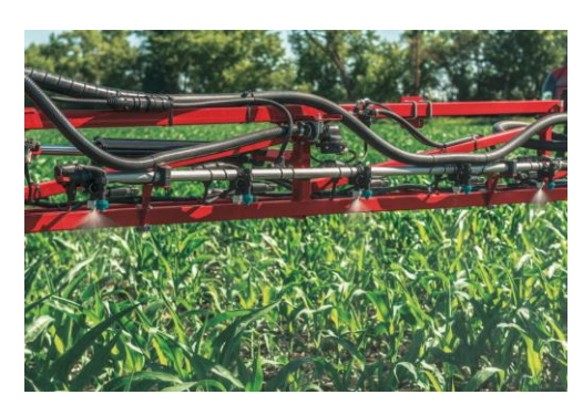
CASE IH AIM COMMAND FLEX

If your heart is set on planting Enlist soybeans, NEW for 2020, NK will be offering a full lineup of Enlist E3 soybeans, maturities 2.4 trough 3.6. Please consult one of our seed specialist at one of our locations today (supply is limited). We can help provide insite on what crop system is right for you.