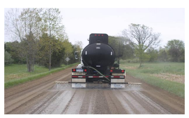
Blue Flame Propane offers 3 product choices for dust control

We are hearing reports that this summer and winter could be another challenging season with terminals shutting down because they can't afford to stay open and allocation running throughout the fall/winter season (and perhaps even during the summer months). Therefore, if you have not yet contracted for the 2020/2021 season, call our office today! Right now pricing is looking good for summer fills and for contract gallons!