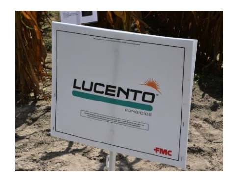
IOWA STATE 2018 FUNGICIDE TRIALS SHOW PROMISING RESULTS

Talk with your trusted advisor at any of our 3 locations for more information about high soybean yield management.